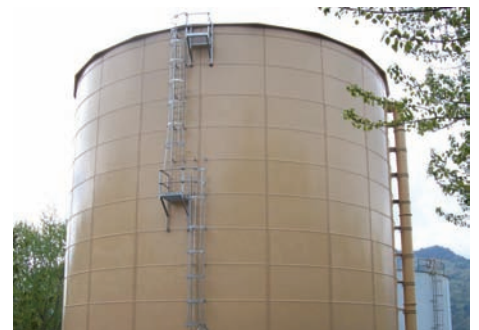
RTP Construction - Potable Water