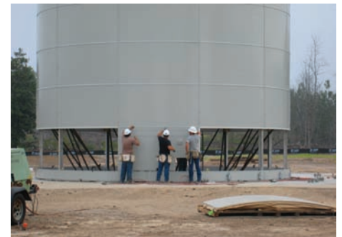
Standpipe - jacked from grade level