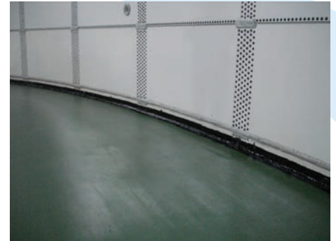
XL Municipal Water Storage Interior Base Setting Ring with Concrete Bottom