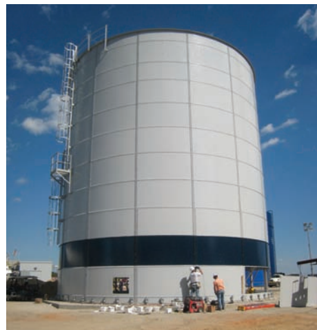
Power Utility - Process Water