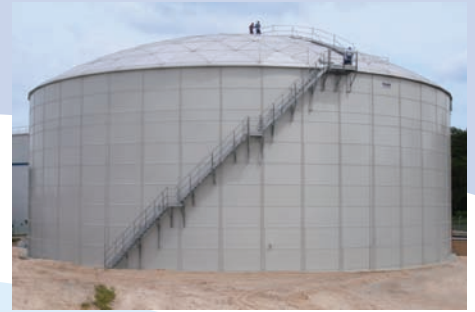
RTP Construction - Potable Water 4.5 million gallons/ 15,000 m 3

For potable water, wastewater, fire protection and industrial liquids, Tank Connection offers unlimited configurations in bolted tank construction from ground reservoirs to elevated water tanks. Standard liquid tank capacities range from 25,000 to 8,000,000 gallons. In all cases, RTP tank construction outperforms other types of bolted tank construction through its superior design, proprietary coating systems and safe field installation processes.